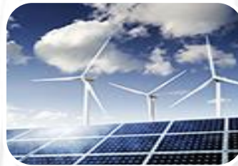
Energy Union and Climate