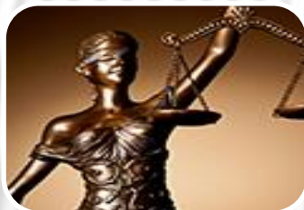
Justice and Fundamental Rights