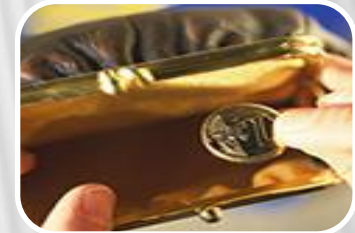
Economic and Monetary Union