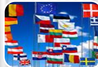
EU as a Global Actor