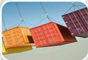
EU-US Free Trade