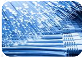
Digital Single Market