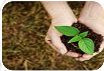
Jobs, Growth and Investment