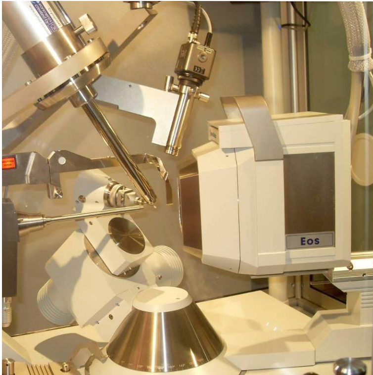
Xcalibur diffractometer from Oxford Diffraction