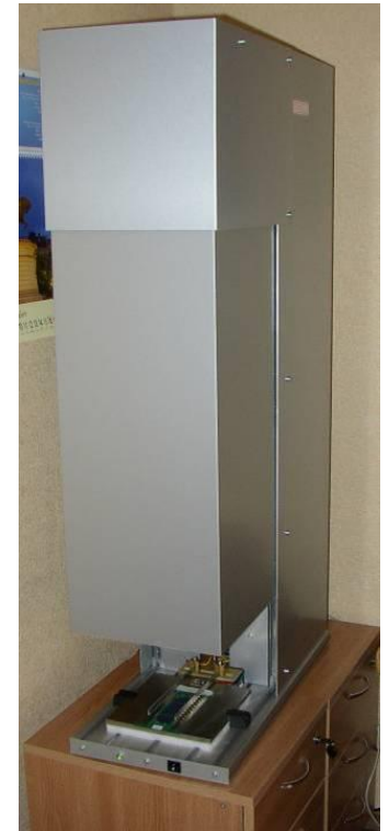
Solar Cell Tester ST1000