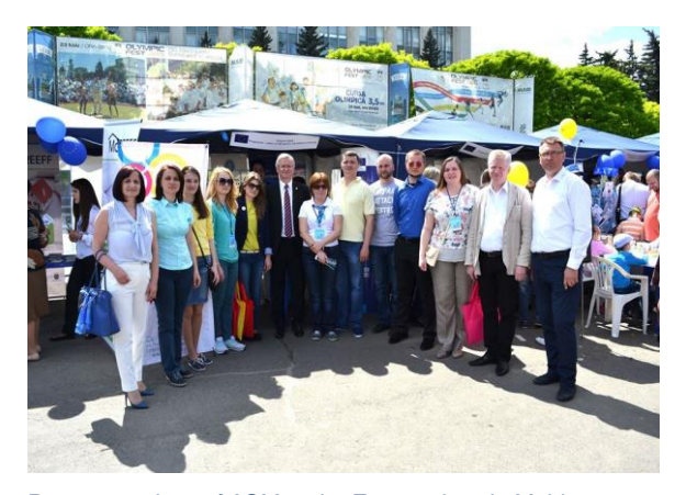
Representatives of ASM at the Europe days in Moldova